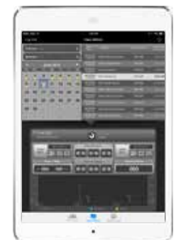
Cognita Tracking Individual Device Data

Let Cognita help you optimize your business with actionable intelligence that turns knowledge into power.