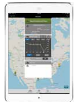
Data at the Individual Account Level